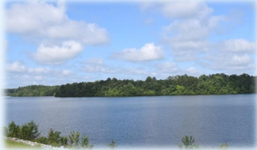
Lake Meriwether, Woodbury, GA